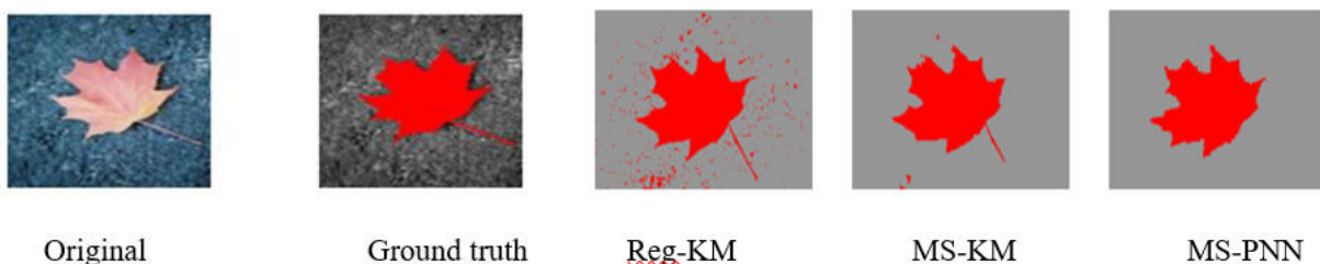
Fig. 2 Image from the work [10] comparing different hybrid methods

In [10], the most efficient PNN variant (k-NN) is adopted for image segmentation using the Mumford-Shah model. The key distinction from prior works is that the method is utilized not merely as a technique for vector quantization but is adapted to specifically incorporate the crucial element of the spatial connectivity of pixels, which is vital for meaningful image regions. The results obtained using the proposed MS-PNN [10] technique demonstrate superior performance compared to both regular K-means (reg-KM) [50] and the Mumford-Shah K-means (MS-KM) [24] techniques.